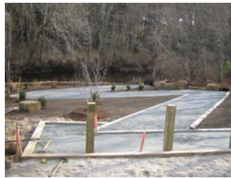
View from the parking area looking down the pathway to the Wood River.