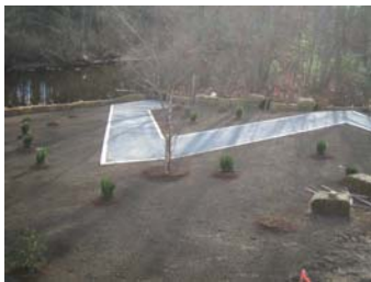
Erosion at the site is now under control, and the ground replanted with native species.

The trees and brush had been scraped away more than 130 years earlier when the land had been cleared to build the Wood River Branch Railroad. Since the railroad was abandoned in 1947, the space has been used as