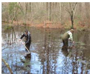
Volunteers hard at work assessing a pool

For many of us, spring is heralded by the sound of wood frogs and spring peepers calling to mates from vernal pools throughout the woods. Vernal pools are important, somewhat enigmatic, breeding habitats for many amphibians and invertebrates. Vernal pools are small basins, usually less than 1 acre in size, and tend to dry up during the summer months. This dry period generally eliminates the possibility of fish presence within the pools and greatly reduces predation upon the amphibian eggs and tadpoles. Certain amphibians, such as the wood frog and spotted salamander, can only successfully breed in vernal pools. This spring over 80 WPWA volunteers, ranging in age from 7 to 70, ventured into the woods to locate and assess vernal pools throughout the Wood-Pawcatuck watershed.