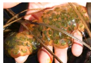
Spotted Salamander Egg Mass

While only two training sessions were initially planned, the response to volunteer recruitment was so tremendous that a third session was added. During these sessions volunteers learned about vernal pools, their important role in the landscape, and the need for their protection. In addition, volunteers were instructed on how to perform a vernal pool assessment and accurately fill out data sheets. While conducting their field studies, volunteers were asked to look for any evidence of the creatures that depend on vernal pools for their life cycles - wood frogs, spotted salamanders, marbled salamanders, and fairy shrimp. After locating their assigned pool from