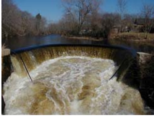
Shannock Horseshoe Falls on the upper Pawcatuck River

The recently completed Shannock Fish Passage Feasibility Study, compiled by engineering consultants Milone and MacBroom, Inc. of Cheshire, CT, outlines several alternatives for achieving fish passage on the upper Pawcatuck River and the Worden Pond spawning habitat.