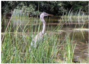
Photo of Charlie the Heron