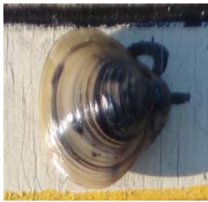
Asiatic clam Corbicula found in Worden Pond in August

Worden Pond is a shallow, sand-silt bottom environment which is ideal for Corbicula clam growth. Populations of 10,000 to 20,000 per meter are not unheard of, and a population of this size will affect and change the phytoplankton, invertebrate and vertebrate populations, as well as the organic dynamics of the pond. The Wood-Pawcatuck Watershed is the cleanest and most