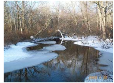
Winter settles along Fisherville Brook in Exeter

Opinions expressed in Watershed are not necessarily those of WPWA, its Board of Trustees, or staff.