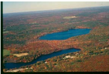
Aerial view of Yawgoo Pond (top) and Barber Pond in South Kingstown.