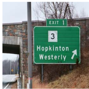
The Exit 1 Hopkinton debate weighs economic development against village life interests.

duced by recent R.I. legislation that attempts to provide more affordable housing units while allowing for higher-density developments that lack adequate infrastructure.