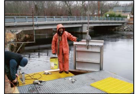
Workers for RI Department of Environmental Management install a new gate and platform at the Potter Hill Fish Ladder on the Pawcatuck River.

Opinions expressed in Watershed are not necessarily those of WPWA, its Board of Trustees, or staff.