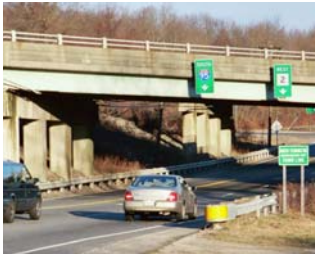
Zoning amendments that would increase development potential at Exit 92 in Stonington are being studied.

The town received a proposal to build 200 residences on an 82 acre parcel under the new state law allowing for high density developments if 20% of the units are so-called "affordable". Similar proposals have been submitted in several other watershed communities. Status: The proposal is under careful scrutiny of the Town's Zoning Board. If rejected, it may be appealed to the R.I. Housing