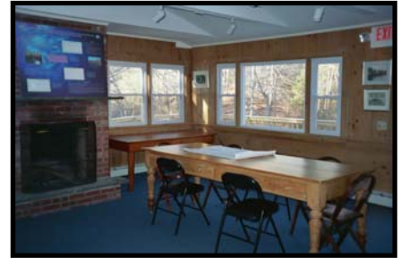
A look inside WPWA's new conference facility at our Barberville campus.

Opinions expressed in Watershed are not necessarily those of WPWA, its Board of Trustees, or staff.