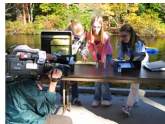
Channel 10 camera captures student monitoring demonstration.

to standardize student monitoring methods in school curricula so the data