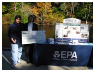
USEPA staff and display with Wood River as a backdrop.