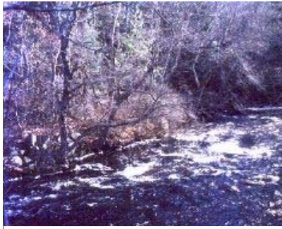
Volume and velocity return to the Wood River.