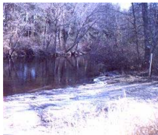
Erosion is common at the Switch Road river access.

and WPWA are discussing a transfer of ownership of the land to WPWA, which will take over for future maintenance of the site.