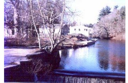
WPWA Campus beside the Wood River at Barberville Dam

Opinions expressed in Watershed are not necessarily those of WPWA, its Board of Trustees, or staff.