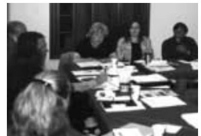
Members of Washington County Regional Planning Council meet monthly.

New England Grassroots Environmental Fund, $15,000, to expand its assistance to groups engaged in sustainable community and environmental issues; Clean Land Fund, $20,000, to support the Fund's provision of technical assistance to community development corporations interested in redeveloping RI Brownfield sites; and $50,000 each, to Conservation Law Foundation for the Brayton Point Clean-Up Campaign, and The Providence Plan, to support further development of the Woonasquatucket River Watershed Council.