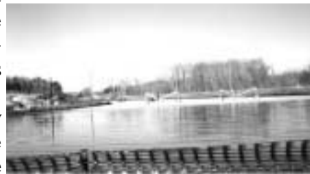
Wastewater treatment lagoon at Kenyon Industries.

back to the turn of the 20th century. Supported by the working stretches of the Pawcatuck River, each has played a significant role in the history and economy of the watershed.