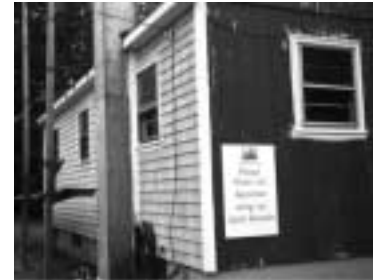
WPWA office undergoing a facelift.

Opinions expressed in Watershed are not necessarily those of WPWA, its Board of Trustees, or staff.