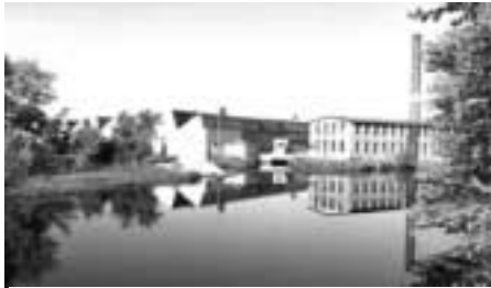
Bradford Dyeing Association on the Pawcatuck River.

Both Bradford Dyeing Association and Kenyon Industries upgraded their treatment systems within the last decade. BDA finished in 1995, and Kenyon followed in 1997. These upgrades, with price tags in the millions, were necessary to improve, among other things, the systems' abilities to remove solids. It is in these solids where concentrations of heavy metals, such as copper and lead, may be found in excess of in-stream water quality criteria.