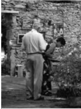
Bidders stake their claims during the silent auction.