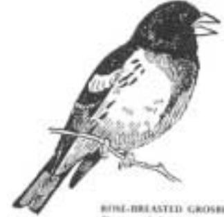
BLUE-BREASTED GROSBEEK Pheucticus ludovicianus

203 Arcadia Road, Hope Valley at Barberville Dam 401-539-9017 wpwa@mindspring.com www.wpwa.org