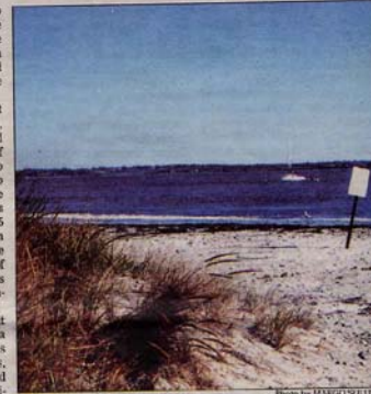
THIRD BEACH: Open space or private property?