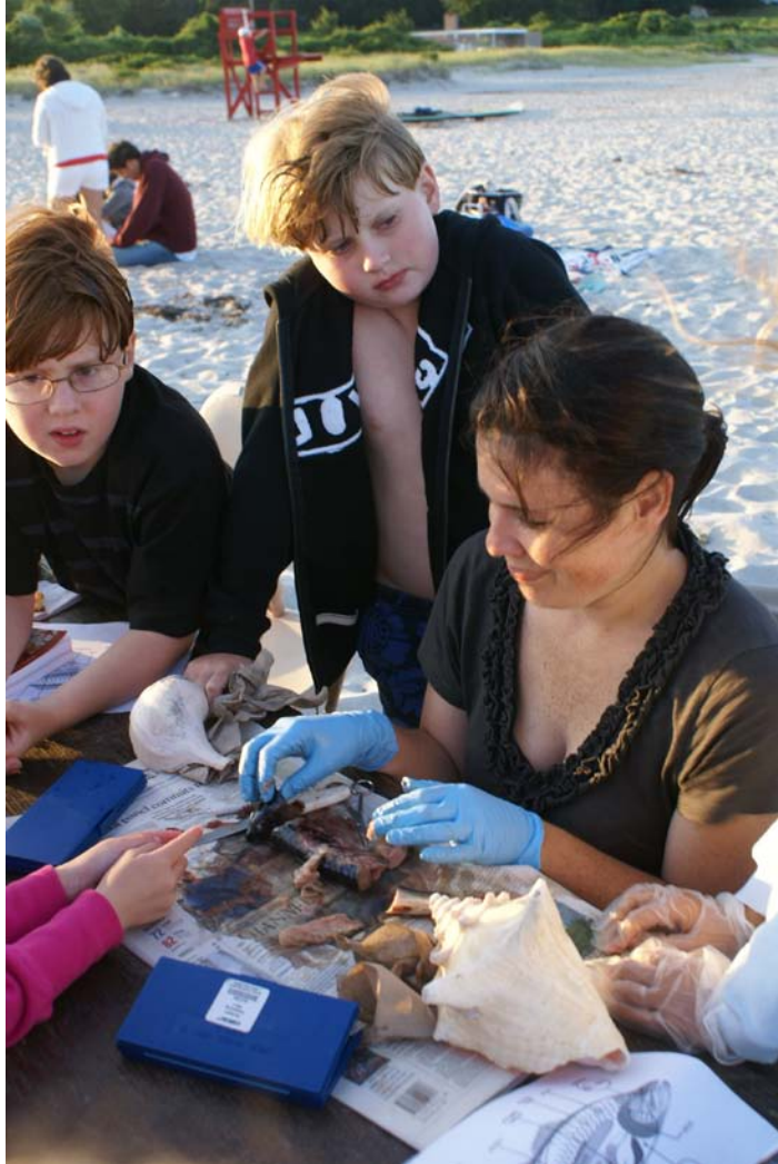
Structured: fish dissection