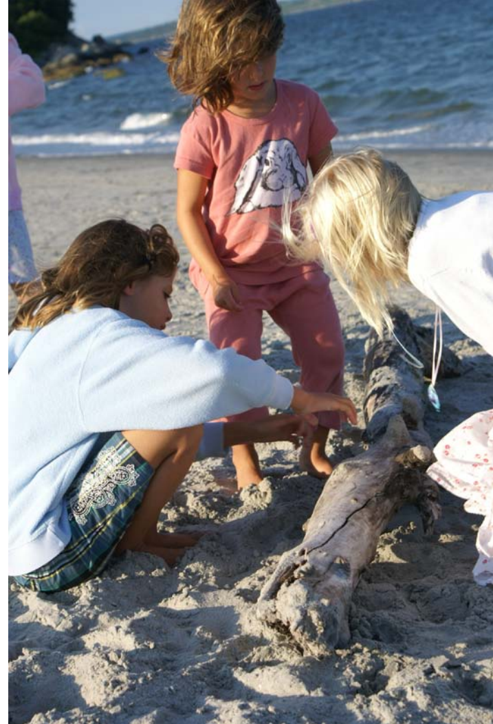
Unstructured: nature discovery